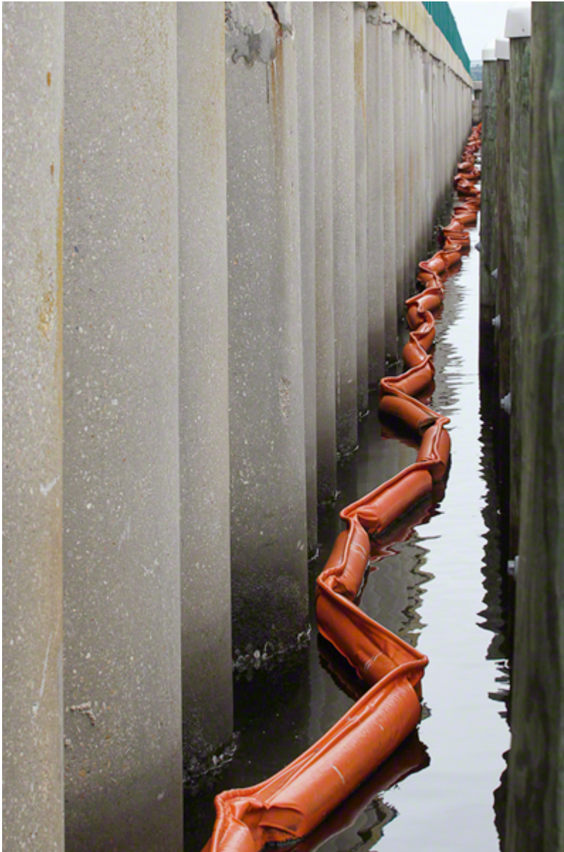
Boom inside Pass Christian Harbor.