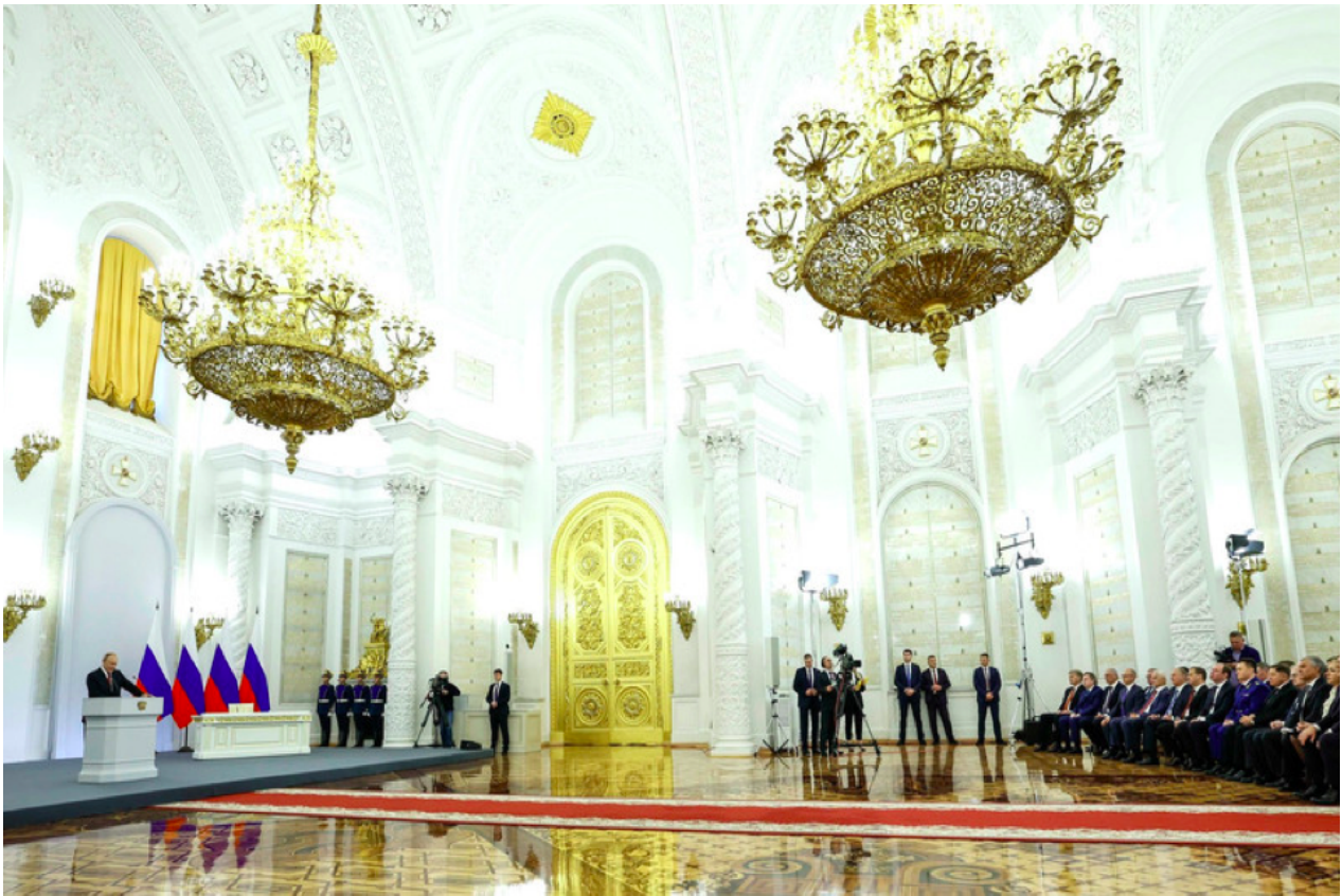
Signing ceremony for the accession of the Donetsk and Lugansk People's Republics and the Zaporozhye and Kherson Regions at the Grand Kremlin Palace's St George Hall

"Meanwhile, the West continued to look for another chance to strike a blow at us, to weaken and break up Russia... to set our peoples against each other and to condemn them to poverty and extinction. They cannot rest easy knowing that there is such a great country with this huge territory and its natural wealth, resources and people who cannot and will not do someone else's bidding.