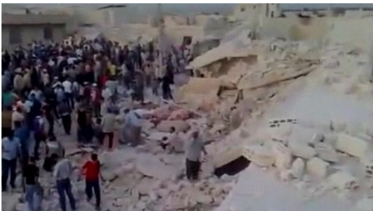
Photo: From Hama, Syria, a city block lies in ruins after a rebel bomb factory mishap caused a massive explosion. At least 70 have been reported killed. In initial attempts to spin and cover up rebel involvement, BBC actually ran with an opposition explanation suggesting the Syrian government fired “SCUD missiles” at Hama. It is now revealed that the rebels are indeed operating bomb factories across Syria and indeed carrying out a terrorist bombing campaign. ....

Not only does this confirm that the Syrian rebels have resorted to indiscriminate terrorist tactics, but reveals again that government claims that an explosion in the city of Hama that killed 70, devastating much of a city block, was in fact a mishap at a rebel bomb-making facility. BBC amazingly attempted to peddle the opposition’s explanation , claiming the Syrian government possibly fired a “SCUD missile” at the city.