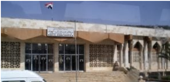
Image: Bab El Hawa boarder crossing from Turkey to Syria in March 2006. (Licensed under CC BY 3.0)

Numerous international and local organisations have expressed serious concerns about the high costs of operations, including due to sanctions-induced rising prices in fuel and the challenges to financial transactions, procurement and delivery of goods and services. They report that foreign banks are often reluctant to process payments destined for Syria, particularly following Lebanon's banking crisis and the spill-over effects on Syria. Restrictions and delays in processing payments with suppliers, which can take months, lead to a restricted and less competitive market, rising costs, putting at risk the implementation of life-saving humanitarian interventions. I have received information that important international humanitarian actors have either significantly reduced their activities or fully withdrew from the country due to these challenges, leaving a serious protection and rehabilitation gap.