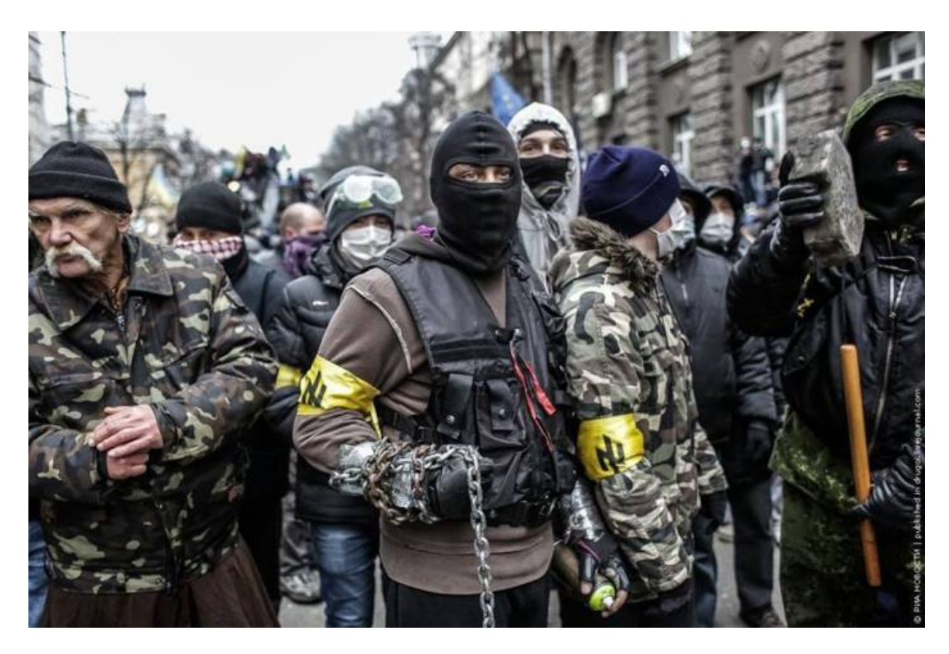
Neo-Nazi Militia in Ukraine