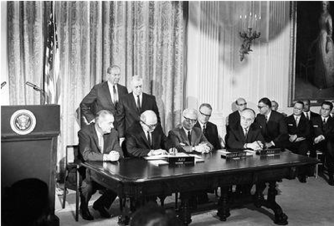
Signing of the Outer Space Treaty in 1967.

Space exploration is giving way to space exploitation and growing competition with Russia, which has developed its own space-based weapon systems in response to what the U.S. is doing.