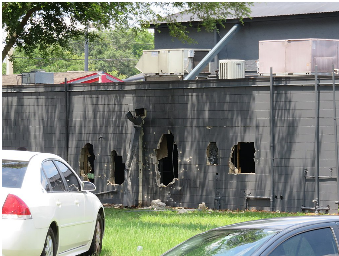
Pulse nightclub exterior, with holes made by the BearCat and bullet holes (Licensed under CC BY-SA 4.0)

Afghanistan was a pawn in the US campaign against the Soviet Union. The amorality of US foreign policy is clear and consistent, from the destruction of Afghanistan beginning in 1978 continuing to the current starvation caused by US freezing of Afghan government reserves.