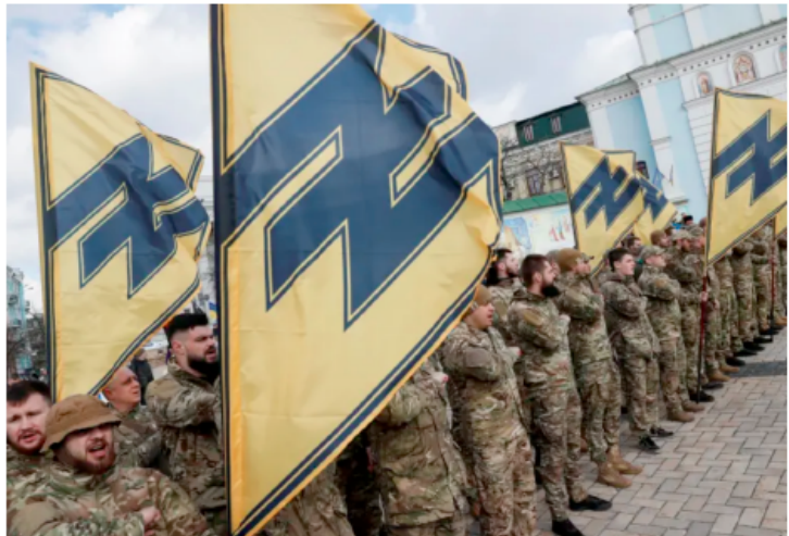
Nazi SS Wolfsangel symbol and Ukrainian Azov battalion boasting the same symbol

These symbols, including swastikas, actually abound, but the corporate media scrubs them with a surfeit of fervor so that we can all maintain the fantasy that we are saving democracy and freedom at any cost.