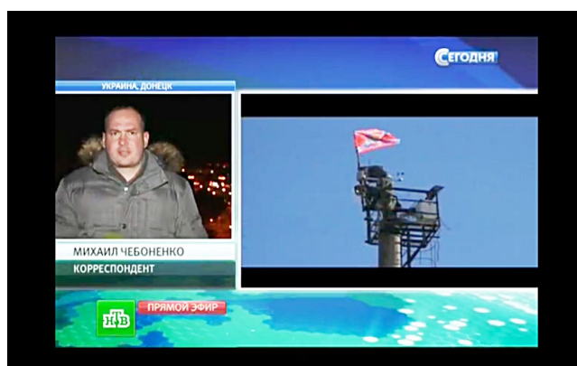
Novorussian flag over Debaltsevo

That the forces in the Debaltsevo cauldron were doomed was pretty clear for a while already, but what is still amazing is the speed at which the collapse has taken place. Clearly, we are dealing with a catastrophic collapse of combat capability of the junta forces.