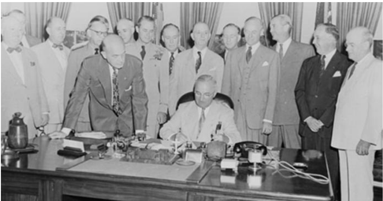
President Harry S. Truman signing off on creation of the CIA.

The immediate target was Soviet Ukraine, which the CIA hoped through its clandestine projects to “crack apart” with saboteurs behind enemy lines.