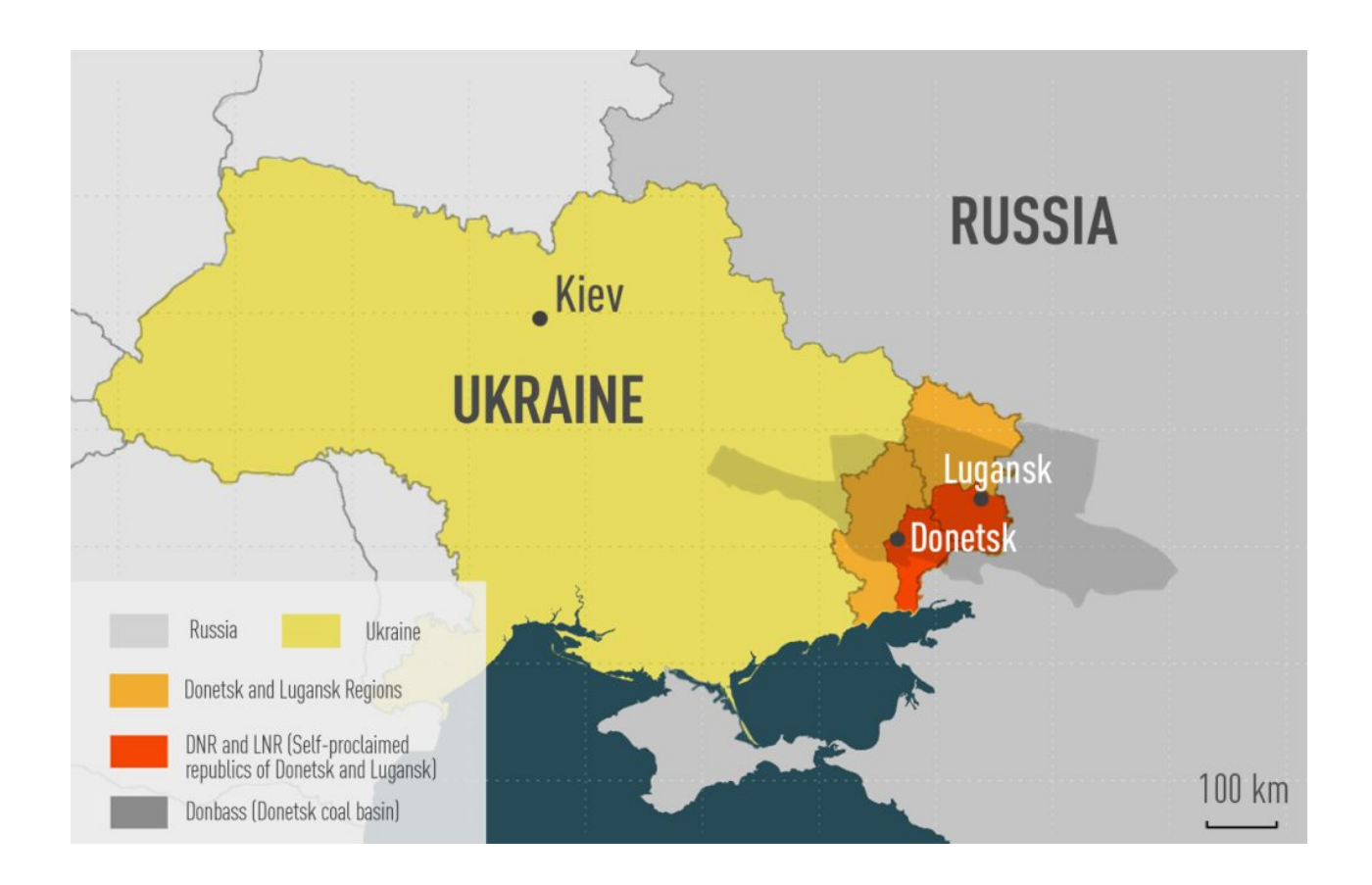
From the author

The ignorant attitude towards the provisions of international public law relevant to the Balkan case resulted, therefore, in the break-up of the Socialist Federal Republic of Yugoslavia, the long wars in its two former federal units (Croatia and Bosnia-Herzegovina) that took about 150,000 lives, produced more than two million displaced people and left behind a region to this day, almost three decades later, it has not politically stabilized and consolidated.