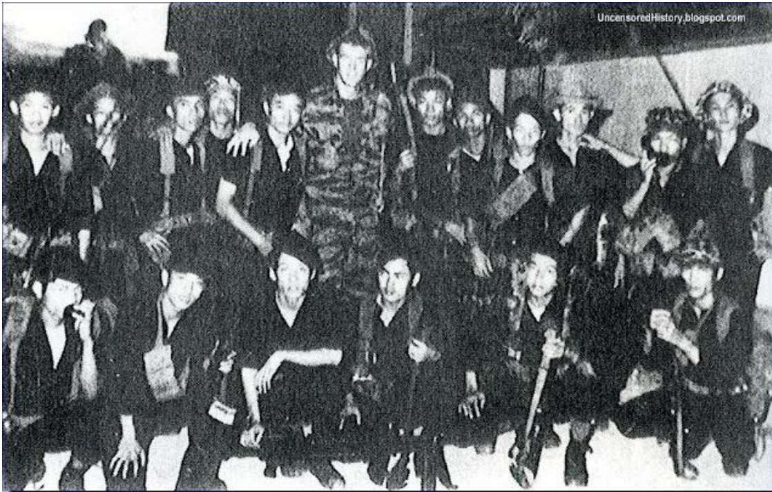
Phoenix Program adviser John Wilbur with local assassination squad.

operation designed to liquidate civilian officials supportive of the National Liberation Front (NLF), which also got out of control and was used to resolve private disputes.