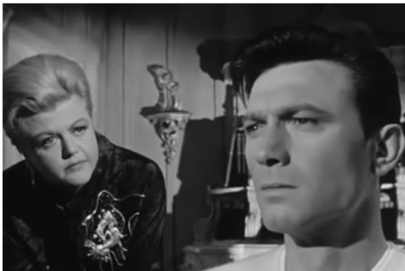
Angela Lansbury and Laurence Harvey in The Manchurian Candidate, in 1962. That movie, and the Richard Condon novel it was drawn from, imagined foreign attempts to direct the outcome of a U.S. presidential election. Yesterday the U.S. government said that Russian hackers have been deliberately trying to change the outcome of this year's race.