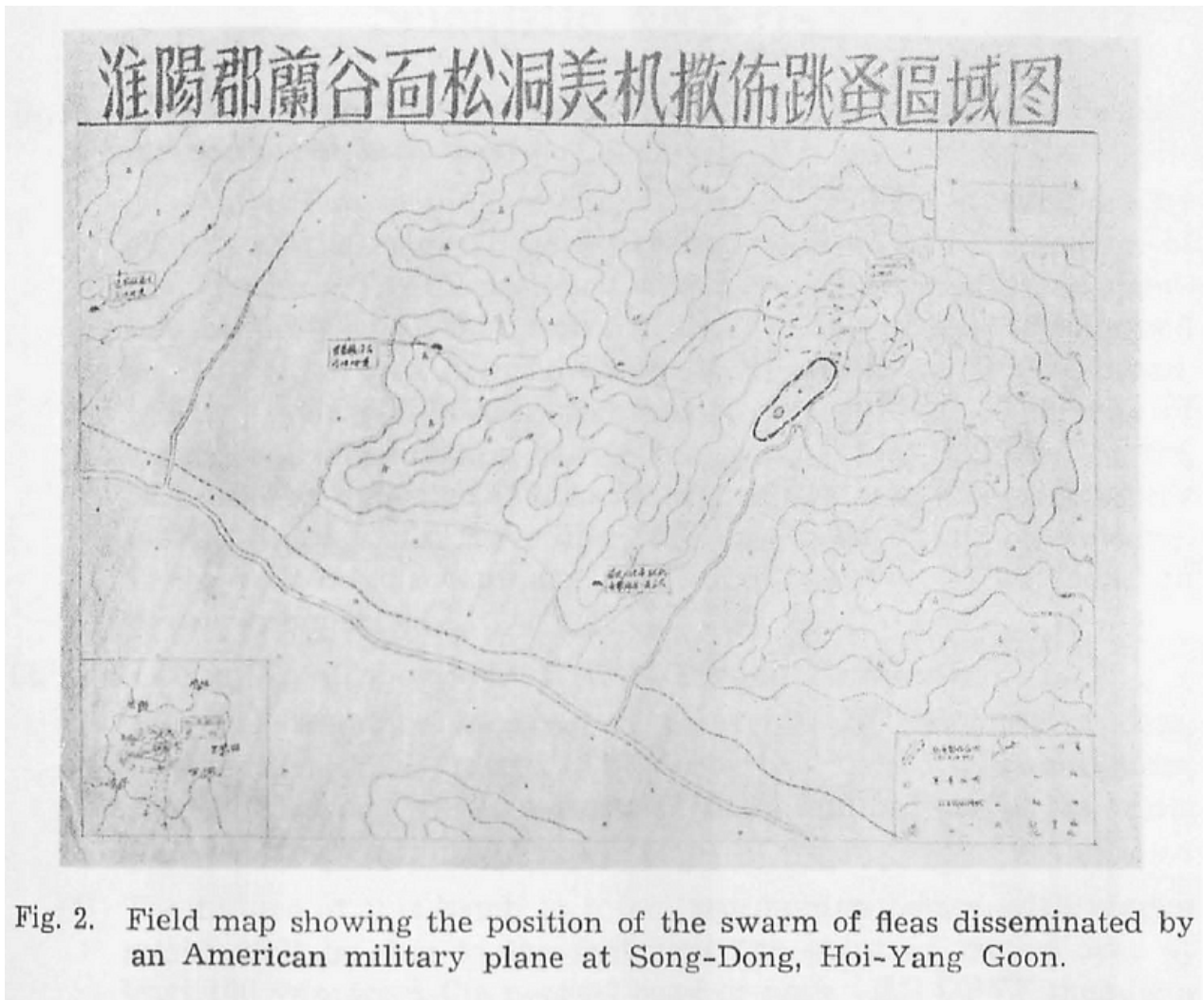
Fig. 2. Field map showing the position of the swarm of fleas disseminated by an American military plane at Song-Dong, Hoi-Yang Goon.

appeared in large numbers after the passage of American planes.... The phenomena of 1952 were, in his opinion, on a considerably larger scale than anything which the Japanese had ever attempted."