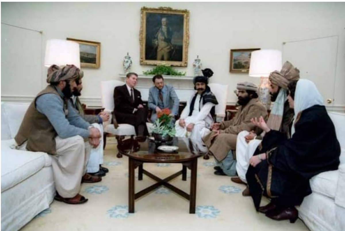
President Reagan and Mujahideen leaders from Afghanistan

Ronald Reagan called the terrorists “freedom fighters”. The US supplied weapons to the Islamic brigades. It was all for “a good cause”: fighting the Soviet Union and regime change, leading to the demise of a secular government in Afghanistan.