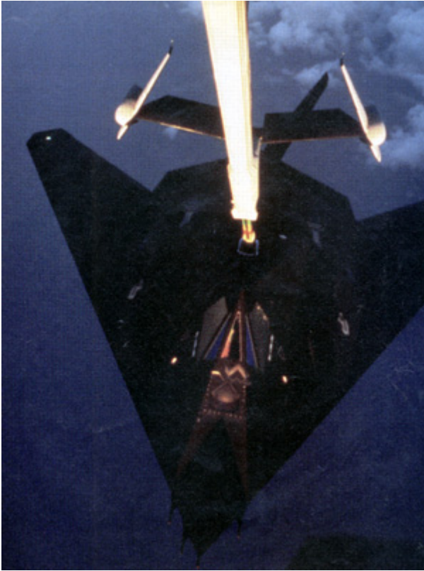
USAF F-117 : vampire in the Iraqi sky

Many Americans thought it was right to attack Iraq, they had no qualms that the country's civil infrastructure was being purposely destroyed and that many thousands of Iraqis were dying. They believed the coalition troops were attacking Iraq to 'liberate' Kuwait* and to prevent an Iraqi attack on the zionist entity.