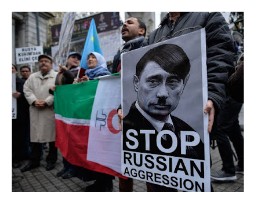
The US State Department's Radio Free Europe/Radio Liberty media outlet in an article deceptively titled, "Putin Warns Crimean Tatars Not To Seek Special Status," indicated that Russia was well aware of the ruse:

Putin suggested that foreign countries were funding rights activists in an effort to "destabilize the situation" by playing up problems faced by Crimean Tatars, the third-largest ethnic group after Russians and Ukrainians on the peninsula, and said that Moscow would not allow this.