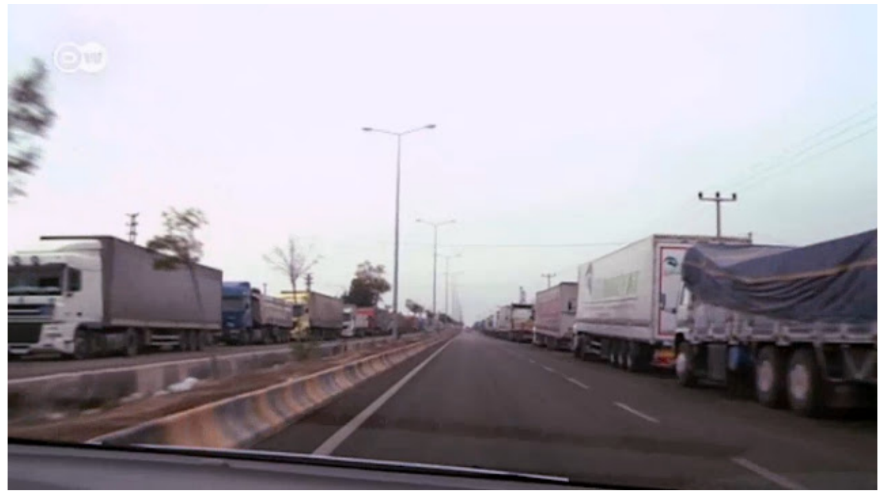
Image: A torrent of supplies cross the Turkish border into Syria destined for Al Qaeda and the self-proclaimed "Islamic State." The US and Turkey have done little to expose this, saying nothing of their inaction to stop it. It was only Russian airstrikes along the border that have finally brought the torrent down to a trickle.

Without President Erdogan's stalwart support, US designs in Syria would have been untenable even before they began. While the US poses as "fighting" terrorist organizations in Syria, it has consistently neglected any attempt to secure the Turkish-Syrian border over which the summation of material support for these terrorist organizations is passing. It must be remembered that not only are the US and Turkey cooperating in regards to Syria, the US has troops stationed within Turkey itself, engaged in various aspects of the ongoing violence in Syria.