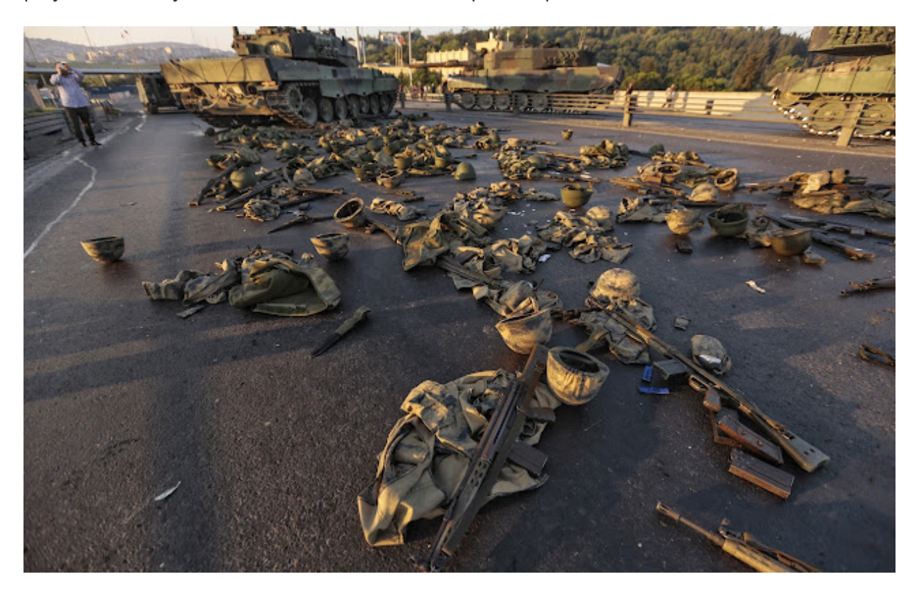
US Faces Serious Accusations

Still, it is too early to tell, as facts are far from forthcoming. However, it is possible to discern the most plausible possibilities based on the subsequent actions taken by various potential players who may have been involved in the coup attempt.