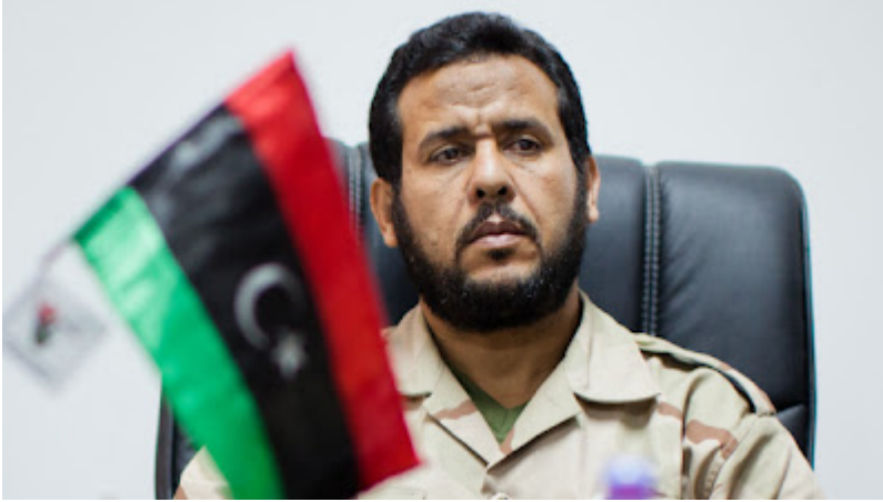
Photo: The face of Libya's "revolution" was literally Al Qaeda. Abdul Hakim Belhaj, commander of the Libyan Islamic Fighting Group (LIFG) listed by the US State Department as a "Foreign Terrorists Organization," was armed and backed by NATO (including the US) in his efforts to topple the government of Libya. Belhaj more recently pledged (NATO) weapons, cash, and Libyan militants to the "Free Syrian Army."