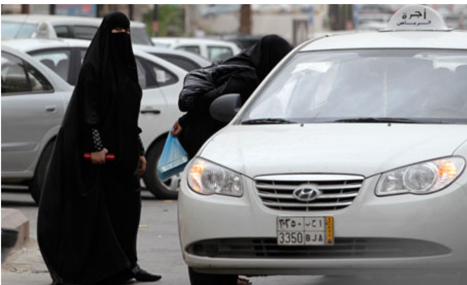
Image: In "progressive" Saudi Arabia, who is calling for a "democratic transition" in Syria, women are not even allowed to drive, let alone vote for their leaders – who with Qatar, are amongst the few remaining absolute monarchies on Earth.

Perhaps as a sign the Gulf States of Saudi Arabia and Qatar are stretched to the limits of their ability to covertly undermine Syria, they have announced plans to seek "UN General Assembly action" for a "political transition and establishment of a democratic government in Syria." For the despotic, unelected, grandiose nepotism of Saudi Arabia and Qatar to call for a "democratic government in Syria" is truly a move made as much out of desperation as it is one of farcical hypocrisy.