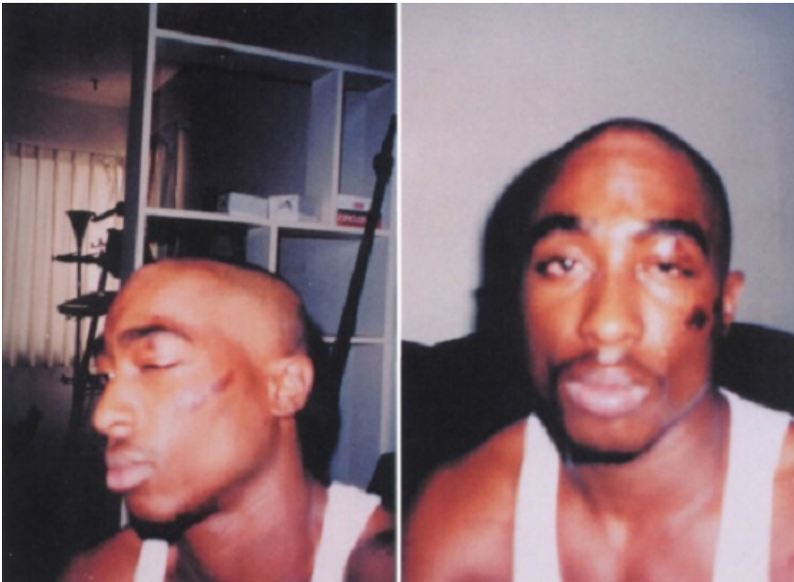
Tupac after being assaulted by police.