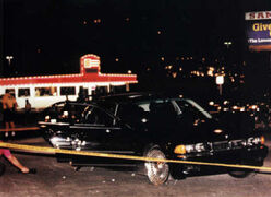
BMW in which Tupac was shot.