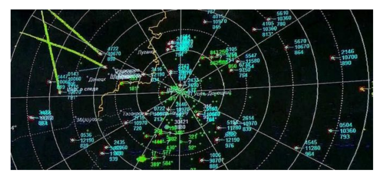
Something Most People Don't Know About MH17.....Ukrainian Gov't Claims Radars Were Not Operational

A number of questions are still to be answered, along with questions about the 'investigation' itself. Why did the DSB not mention the complete lack of primary radar availability in Eastern Ukraine airspace in the final report? Despite the fact that the Ukraine air traffic controller did not have primary radar available, airspace was not closed on July 17, 2014. Without primary radar, an air traffic controller cannot see military aircraft on his radar screen. Thus, if a civil aircraft needed to descend and ATC does not have a clue about the position of military aircraft in the national airspace there could have quite easily been a crash. Normally airspace would be closed, especially over a war-zone, if there was no radar working for air traffic control.