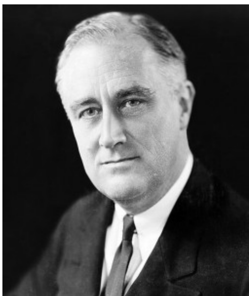
President Franklin Roosevelt

Regarding domestic policy, some Republicans expect that Trump will simply sign off on whatever Ayn-Rand-inspired legislation that House Speaker Ryan pushes through Congress, whether turning Medicare into a voucher program or privatizing Social Security.