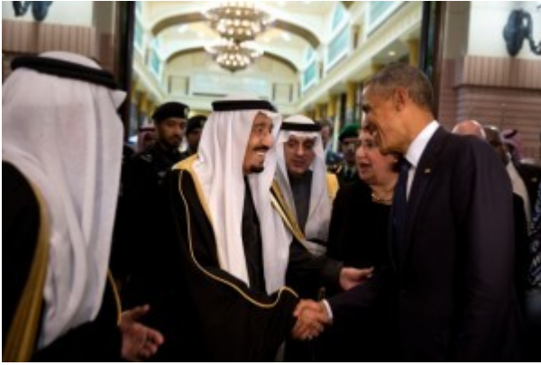
Saudi King Salman bids farewell to President Barack Obama at Erga Palace after a state visit to Saudi Arabia on Jan. 27, 2015.

Facing down such a powerful coalition of Israel (with its extraordinary U.S. lobbying apparatus) and Saudi Arabia (with its far-reaching financial clout) would require both imagination and courage. It would not be possible if Trump surrounds himself with senior advisers under the thumb of Prime Minister Netanyahu and King Salman.