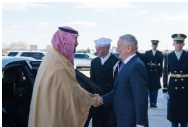
Defense Secretary Jim Mattis welcomes Saudi Deputy Crown Prince and Defense Minister Mohammed bin Salman to the Pentagon, March 16, 2017.

"we have signals intelligence and geospatial intelligence," but then added that "we cannot publicly release all available intelligence on this attack due to the need to protect sources and methods."