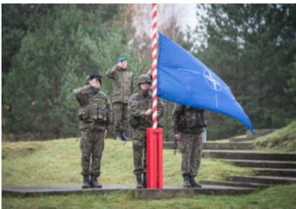
The NATO flag is raised during the opening ceremony for Exercise Steadfast Jazz in Poland, Nov. 3, 2013.

But NATO became the "defensive" blob that kept growing and growing, partly because that is what bureaucracies do (unless prevented) and partly because it became a way for U.S. presidents to show their "toughness." By early 2008, NATO had already added ten new members – all of them many "inches" to the east of Germany: the Czech Republic, Hungary, Poland, Bulgaria, Estonia, Latvia, Lithuania, Romania, Slovakia and Slovenia.