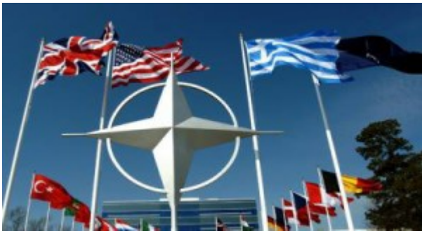
NATO headquarters in Brussels, Belgium.

Here what Ambassador Burns wrote in his summary, which the public knows because the cable was among the thousands leaked to WikiLeaks by Pvt. Bradley (now Chelsea) Manning, for which she was imprisoned for seven years and only recently released (yet the cable has been essentially ignored by the corporate U.S. news media):