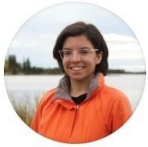
Niki Ashton ✓ @nikiashton

right in the Canadian Parliament. First to stand up against Trudeau's non-response was the opposition social-democratic party NDP Member of Parliament Niki Ashton.