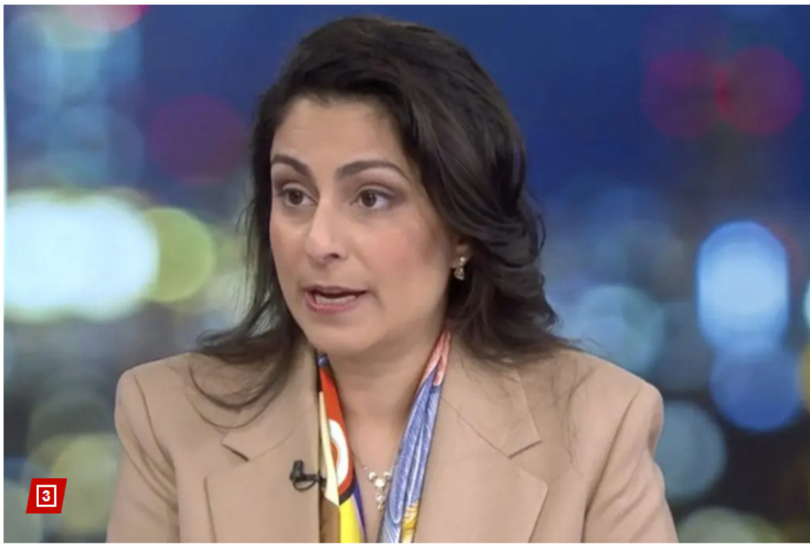
Grant Wahl's wife, Céline Gounder, is an epidemiologist and a contributor to CBS News.

"I am so thankful for the support of my husband soccer family & of so many friends who've reached out tonight. I'm in complete shock," Gounder tweeted in response to U.S. Soccer's official statement on his death.