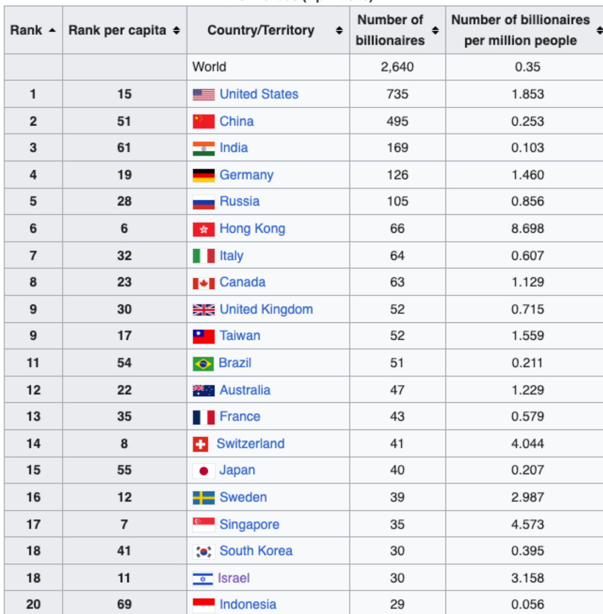
Per Forbes (April 2023) [1]

Trillionaires – This class does not even exist in the media or academic circles. Above the billionaire class are the invisible trillionaires, who are never mentioned by Forbes, or any other list of the wealthy. Nobody really knows how much they are worth. Generally speaking, it is assumed by the alternative community, that people like the Rothschilds and the Rockefellers are at the top of this list, and the best guess is that there are about 300 trillionaire families at the top of the heap. These families are mostly American, British and European aristocracy, with a handful of Russian oligarchs and Hong Kong Chinese thrown in for good measure. They include the DuPont, Astor, Cabot, Oppenheimer, Schiff, Warburg, Russell, Onassis, Morgan, Kennedy, Bush, Clinton, Vanderbilt, and virtually, the entire European monarchy.