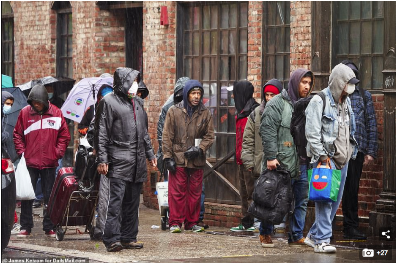
Long lines continued to form outside food banks and unemployment offices in dozens of cities over the weekend as the coronavirus pandemic takes a heavy toll on families, leaving many unsure of when their next paycheck will come. Pictured: Hundreds of people wait to receive meals at the Bowery Mission in New York City on Monday