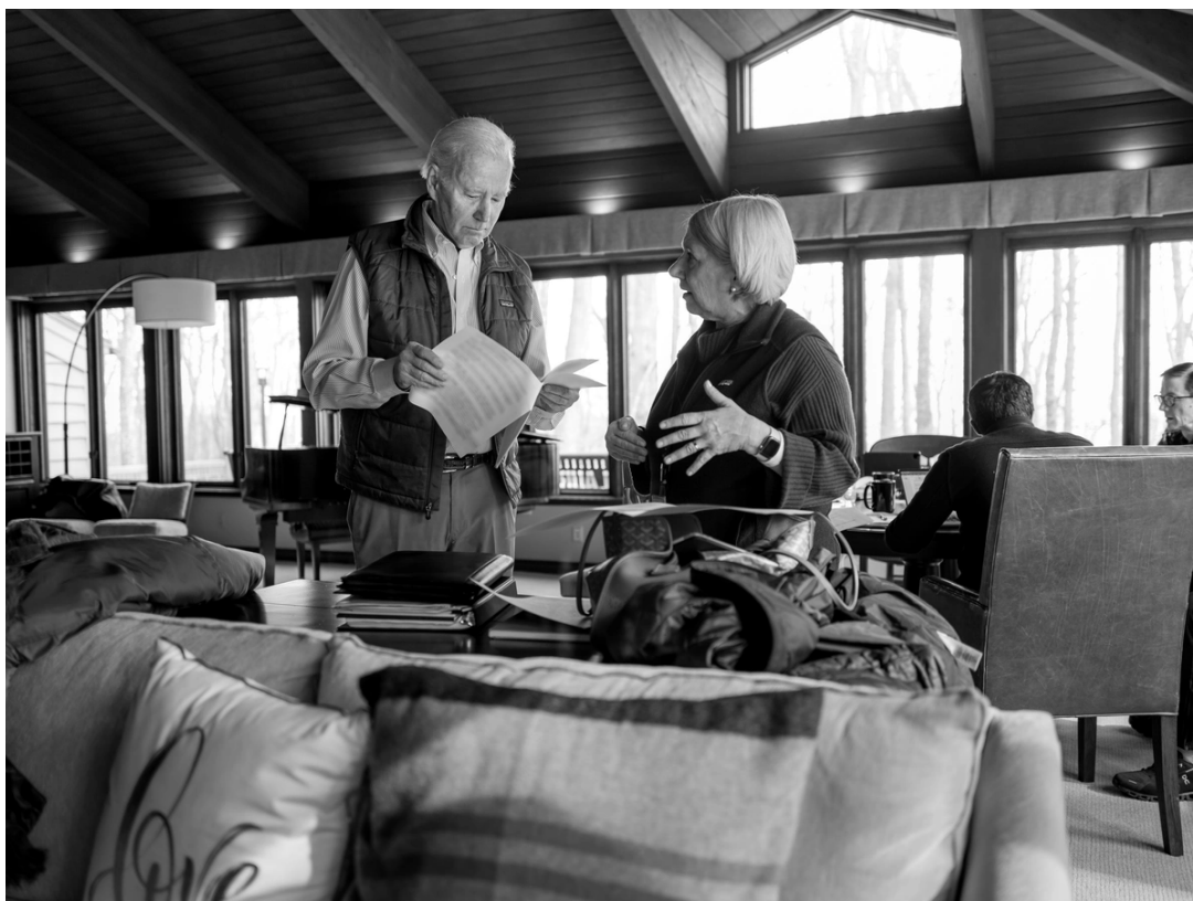
Joe Biden speaks with SKDK’s Anita Dunn ahead of his State of the Union address in February 2023.

Since its founding in 2004, the company has careened from damaging scandal to damaging scandal yet consistently secures major, big-ticket clients. The reason for this is clear. SKDK was founded by and employs a retinue of high-ranking, well-connected Democratic operatives. Among them is Anita Dunn, Barack Obama’s White House Communications Director, credited as the “mastermind” of Joe Biden’s 2020 election win and widely regarded as a key member of the President’s “inner circle.”