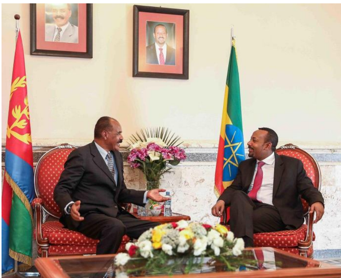
Abiy Ahmed with Eritrean President Isaias Afwerki in March 2019.