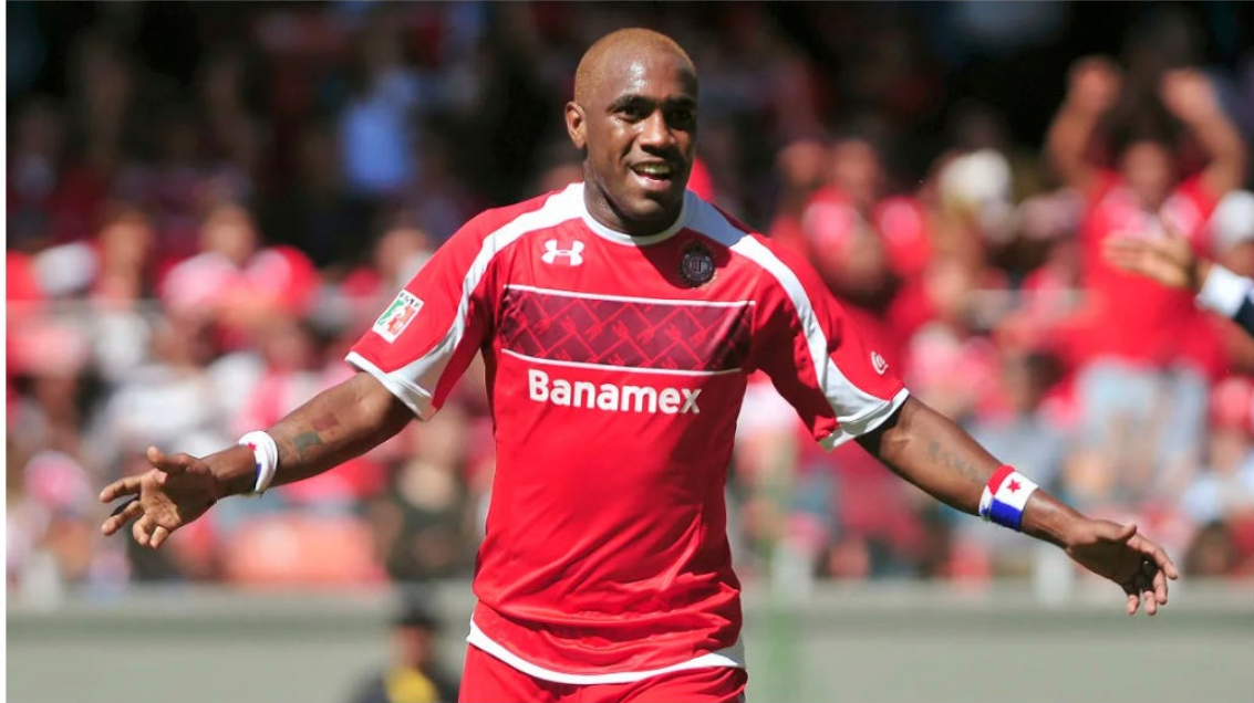
Luis Tejada is Panama's all-time leading scorer.

(CNN) — Former Panama striker Luis 'Matador' Tejada, who helped the national team qualify for its first ever World Cup in 2018, has died at the age of 41, the Panamanian Football Federation (FEPAFUT) announced on Sunday.