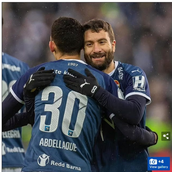
He died on what was due to be his first day working with Stromsgodset, who mourned his death in a statement