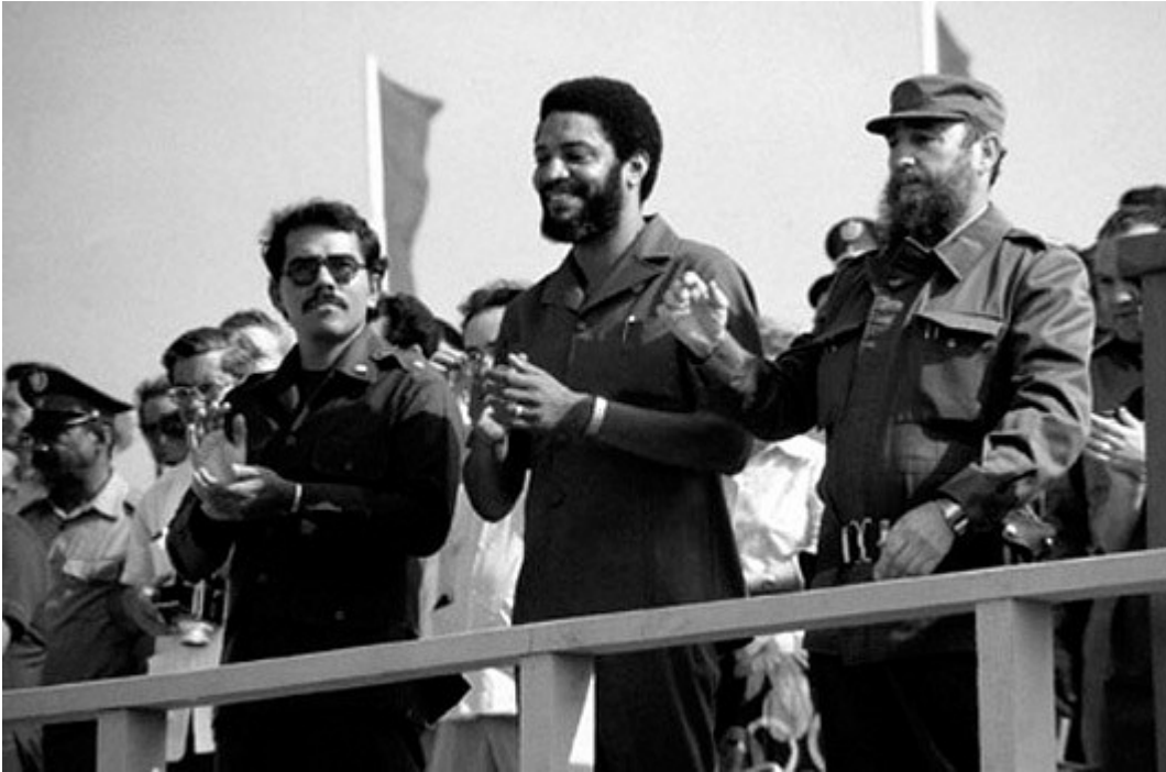
[From left to right: Daniel Ortega (Nicaragua), Maurice Bishop (Grenada), Fidel Castro (Cuba).]

While it is a fact that the U.S. has been at war almost continuously since it gained independence from Britain, there have been brief periods of a few years every now and again in the past 200 plus years where U.S. troops were not mobilized on some international adventure. The period between the end of the Vietnam war and the invasion of Grenada was one such period, and Ronald Reagan was elected on a sweeping tide of bruised and thus ultra-jingoistic nationalism and fanatical anti-communism, with the promise of reversing what rightly appeared to be the start of a global tide rising against U.S. dominance. Not just literally fighting communists where it was feasible—as in very small and almost defenseless locales such as Grenada—Reagan also spearheaded the neoliberal era that continues to the present, with its rollback of trade unions and collective bargaining, the deregulation of the economy, the financialization and de-industrialization of the U.S., and the upward flow of capital toward the already wealthy.