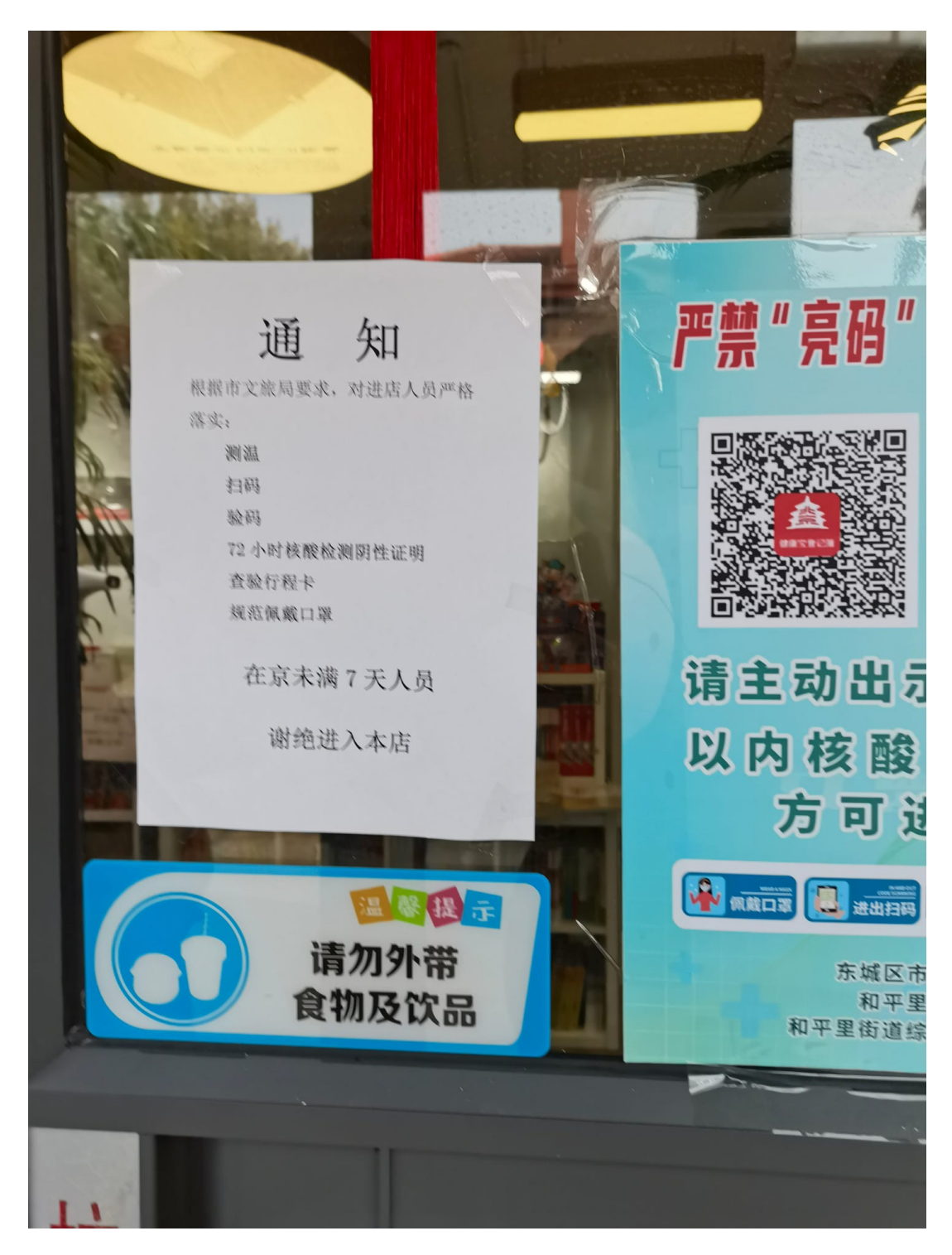
Store shut down in Changsha by obscure COVID-19 directives and demand for QR codes for use of facilities.

China is not an inscrutable Fu Man-Chu power deviously plotting to take over the world, but rather a victim of multinational corporations determined to destroy any resistance to a neoliberal consensus in China.