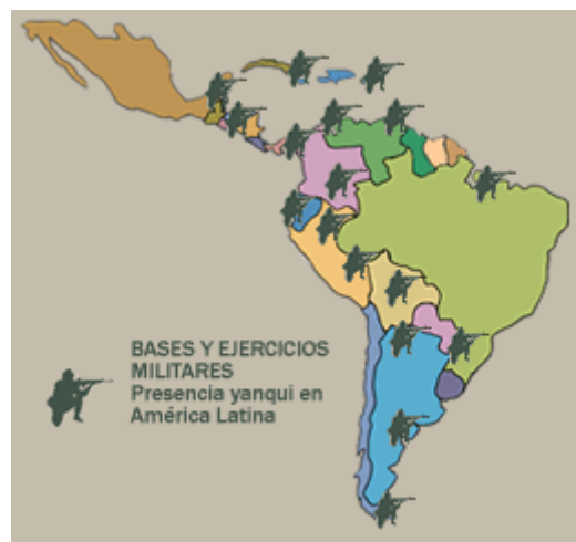
Map 5. The Southern Command