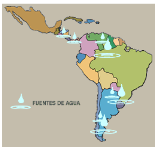
Map 10. Freshwater Resources in Latin America