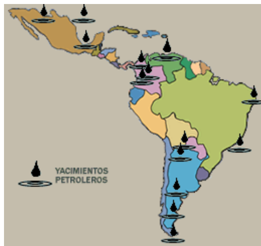
Map 8. Oil Fields in Latin America