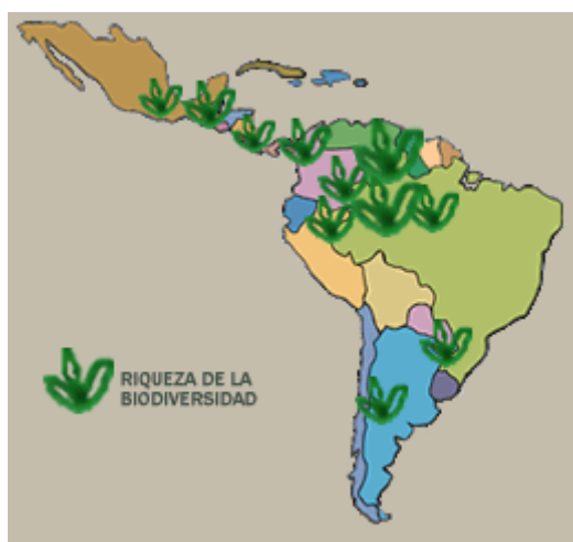
Map 9. The Biological Wealth of Latin America