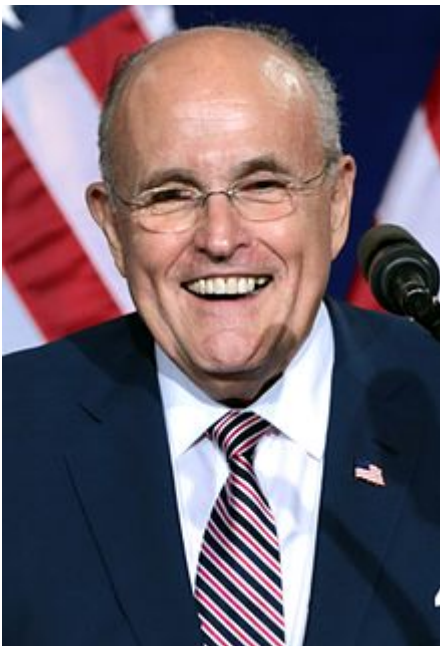
US attorney Rudy Giuliani

“I know from first hand experience how seriously the career prosecutors and agents take their responsibility to make fair and impartial decisions based solely on the facts and the law and nothing else”