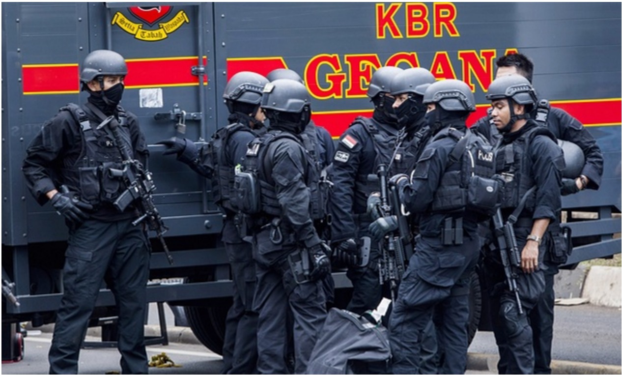
Image: In the aftermath of ISIS attack in Jakarta, Indonesia.

Political impasses in Southeast Asia revolving around America's waning influence in the region have been met with the sudden and otherwise inexplicable appearance of ISIS. In one case, Indonesia signed a large rail deal while pursuing other economic and military partnerships with Beijing, before suffering its first ISIS attack in its capital, Jakarta .