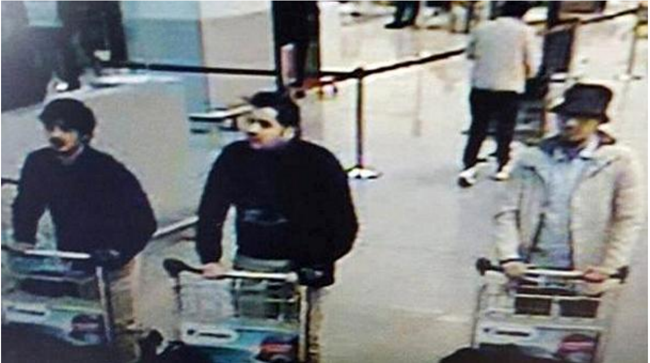
Image: The Brussels bombing suspects... Every single one of these men were in the custody of Western security agencies for violent crimes or terrorism-related charges.

For fisheries around the world, the concept of “catch and release” allows anglers to enjoy the fishing experience while preserving the numbers and health of fish populations. The concept of “catch and release” for Western security and intelligence agencies appears very similar – to maintain the illusion of counterterrorism operations, while maintaining the numbers and health of terrorist organizations around the world.