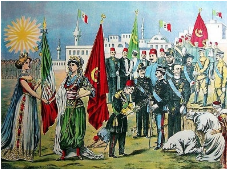
Libya and the Italo-Ottoman War

There have been longstanding designs for dividing Libya that go back to 1943 and 1951. This started with failed attempts to establish a trusteeship over Libya after the defeat of Italy and Germany in North Africa during the Second World War. The attempts to divide Libya then eventually resulted in a strategy that forced a monarchical federal system onto the Libyans similar to the “federal system” imposed on Iraq following the illegal 2003 Anglo-American invasion. If the Libyans had accepted federalism in their relatively homogenous society they could have forfeited their independence in 1951. [1]