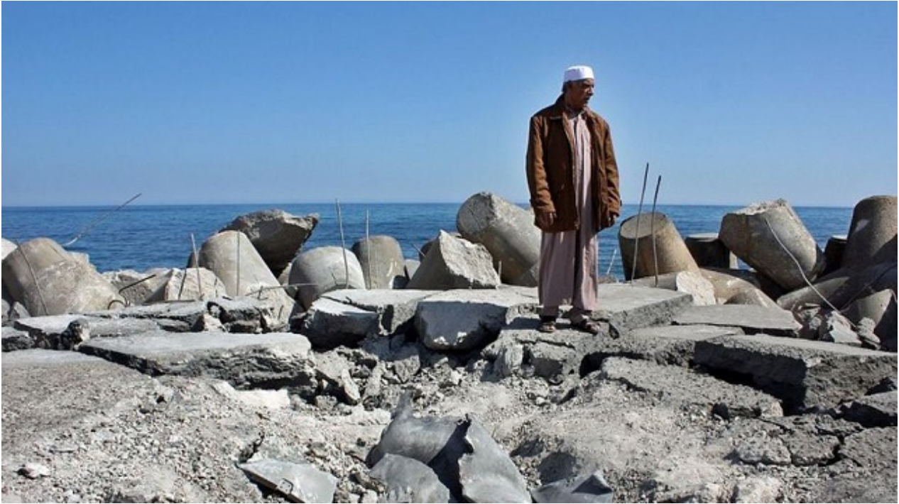
A Libyan man stands on Sirte's bombed fishing harbour. May 12, 2011