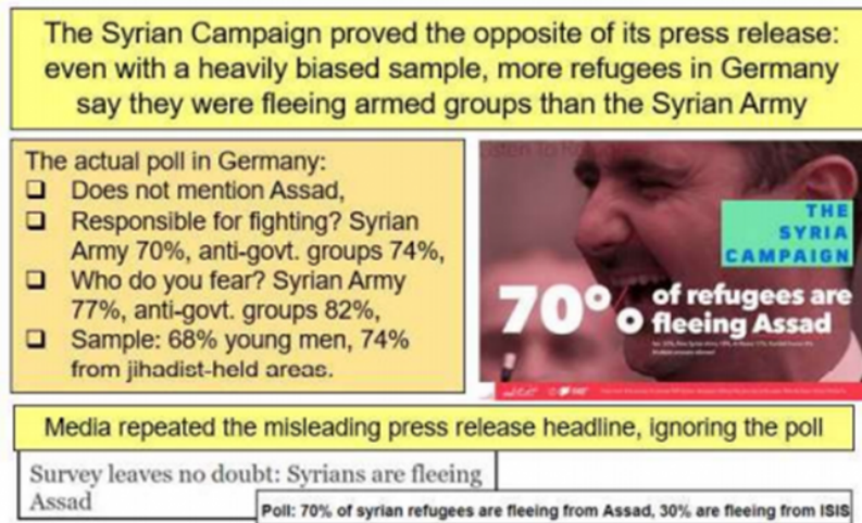
Graphic 7: 'The Syria Campaign' poll demonstrates the opposite of its headline