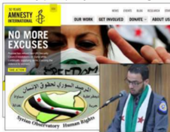
Graphic 5: What conflict of interest? Amnesty, like the 'White Helmets' and the 'Syrian Observatory' (SOHR) all fly the red starred flag of the armed jihadists