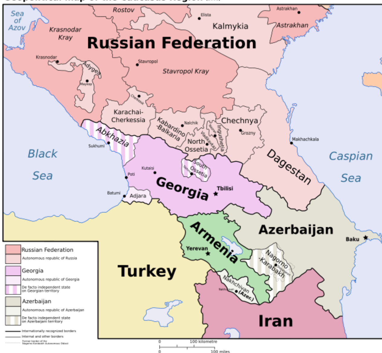
Geopolitical map of the Caucasus Region (2008)

Georgia is one of the fastest militarizing states. To counter Georgian militarization and NATO's agenda for the Caucasus, the Kremlin has beefed up Russian units in the North Caucasus and expanded its military presence in Armenia. In August 2010, Russia and Armenia signed a bilateral military agreement that committed Russia to protecting Armenia and insuring Armenian security. [24] The new Russo-Armenian military agreement has formally allowed Russia to project its military power from Armenia towards Georgia and the Republic of Azerbaijan, whereas the old mandate of Russian troops in Armenia was to provide border security for the Armenian-Turkish and Armenian-Iranian borders. These strategic steps taken by Moscow and Yerevan are in preparation for further crises in the Caucasus.