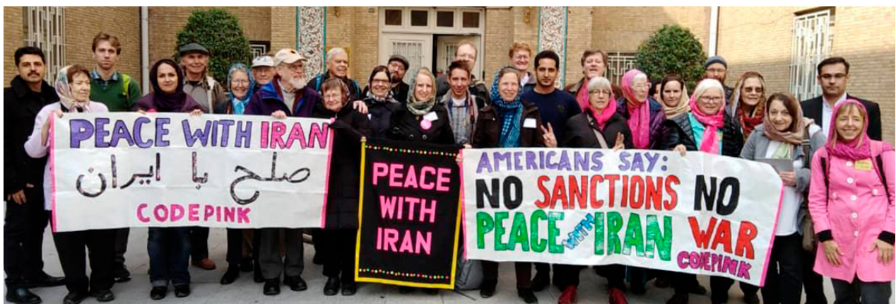
US Peace Delegation to Iran February 2019 outside of Iran's Foreign Ministry.

"...the U.S. difficulty with Iran is not because of the region, not because of human rights, not because of weapons, not because of the nuclear issue – it's just because we decided to be independent – that's it – that's our biggest crime."