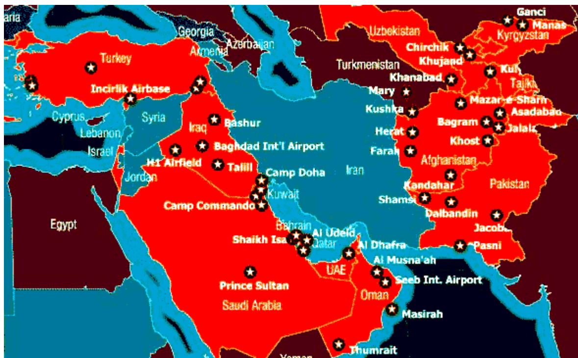
US military bases around Iran.