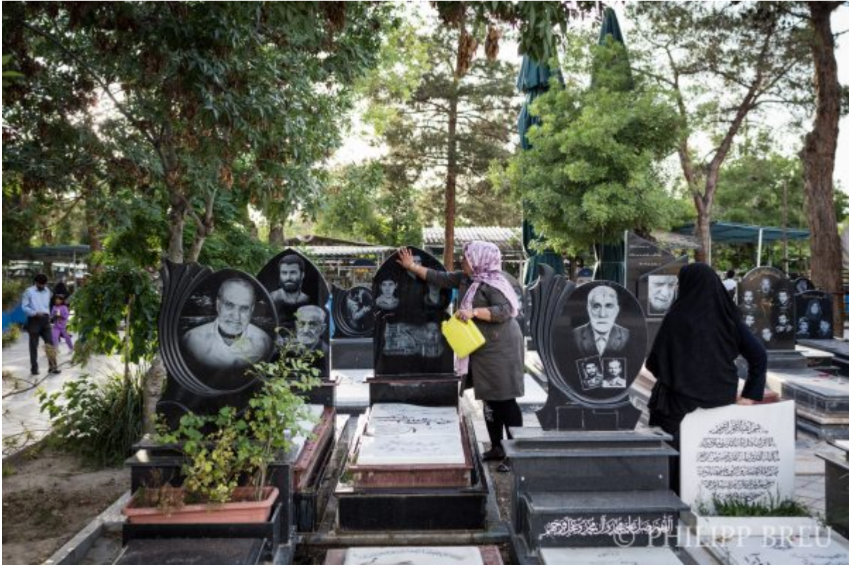
Graves of martyr's from the Iraq-Iran War at the central cemetery of Iran's capital Tehran.