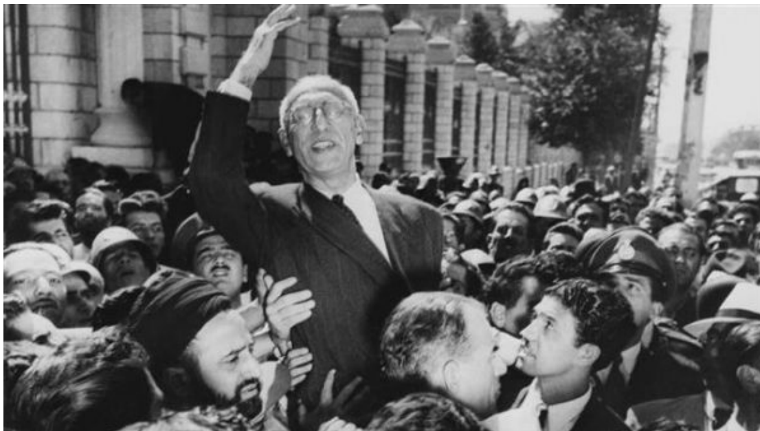
Iran Prime Minister Mohammad Mosaddeq.

Correcting the relationship between the US and Iran begins with an honest review of US policy since 1953. It is a record for which the US should be ashamed and shows the need for a new approach.