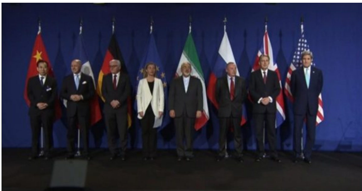
Announcement of the Iran Nuclear Agreement between six world powers and Iran in the Swiss town of Lausanne.

The US has imposed economic sanctions since the Islamic Revolution began. In 1980, the US broke diplomatic relations with Iran and Carter put in place sanctions including freezing $12 billion in Iranian assets and banning imports of Iranian oil. Every president since Carter has escalated sanctions against Iran. In response, Iran has developed a “resistance economy” where it has become more self-sufficient and built relationships with other countries.