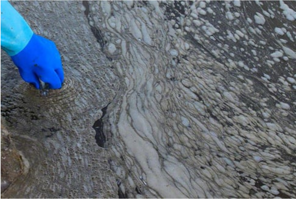
Foamy substance along shoreline at Long Beach, Mississippi that tested positive for crude oil.

On January 7, federal and Louisiana officials took a boat tour of an area in southern Louisiana that remains fouled with oil from the BP disaster. They found areas in Barataria Bay where oil continued to eat away at the fragile marshland, where no protective boom nor cleanup workers could be found. Affected areas were up to 100 feet wide in some sections.