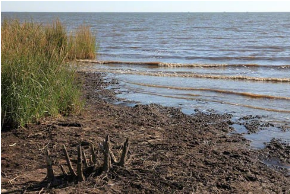
Blood Beach in Ocean Springs, Mississippi.

Samples were also taken from a beach in Ocean Springs, Mississippi.