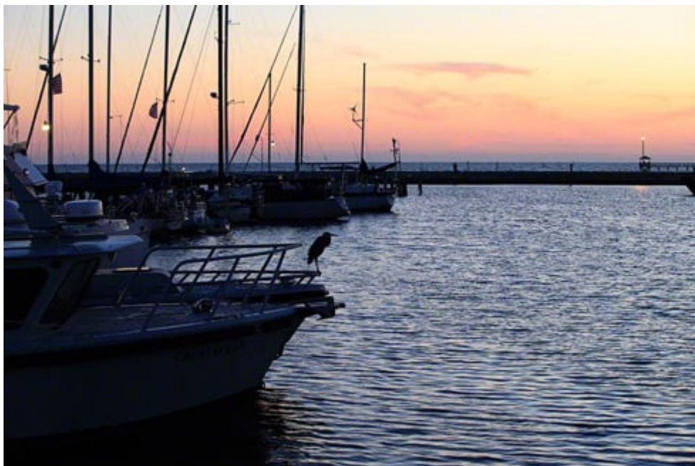
Pass Christian Harbor at dusk.

The samples were tested in a private lab via gas chromatography by an analyst who requested anonymity.