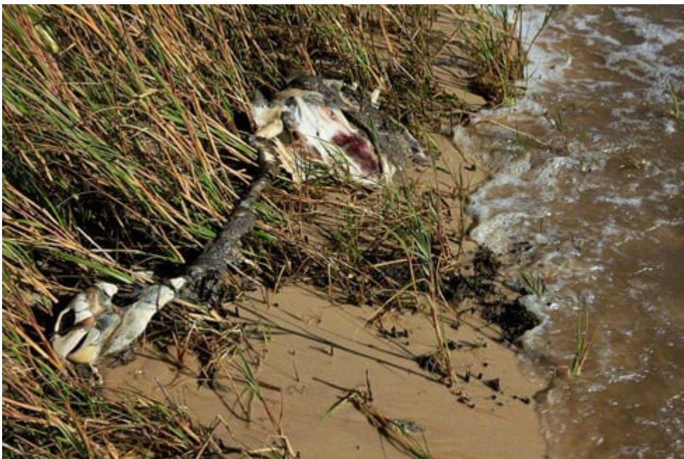
Dead sea turtle, Blood Beach, Ocean Springs, Mississippi.

Another water sample from the beach contained diethylene glycol BE.