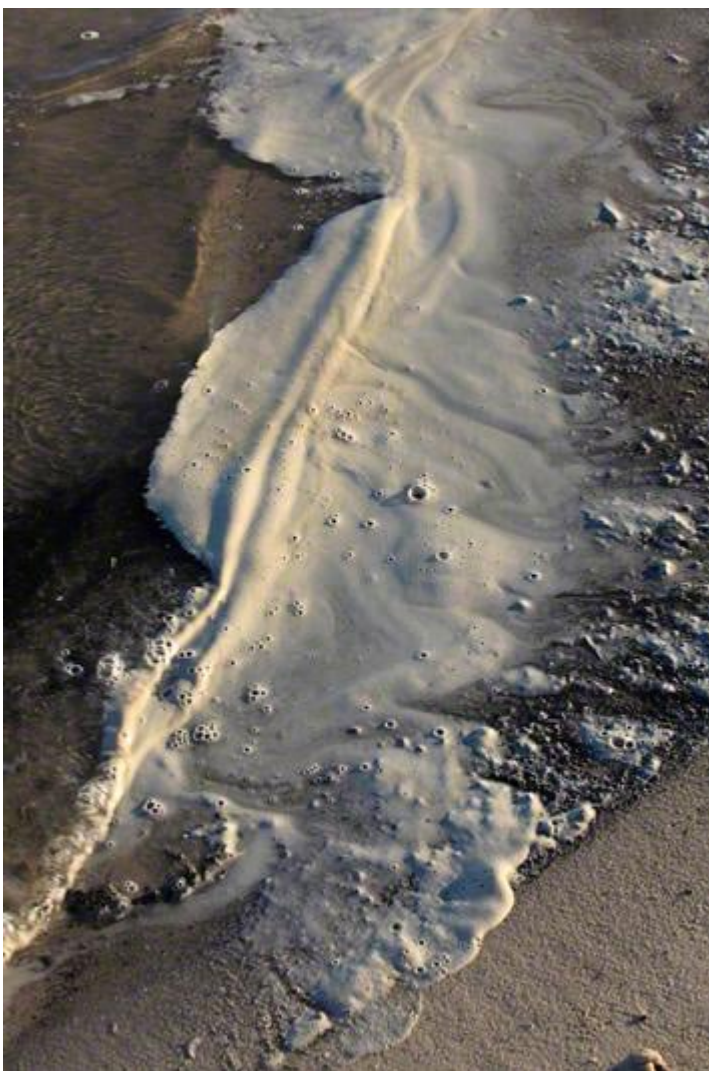
Foamy substance at Long Beach, Mississippi that contains oil and ethylene glycol.

Samples with no oil or chemicals should test at 0 ppm.