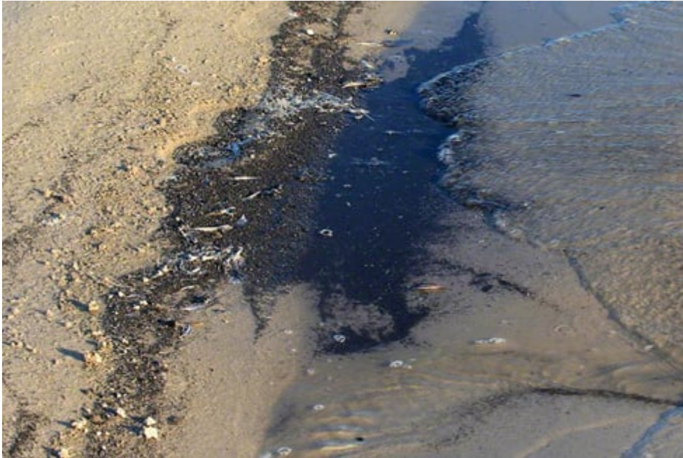
Black granular material at Long Beach, Mississippi that tested positive for crude oil.

The US Coast Guard, federal government and BP claim that no dispersants have been used since mid-July.