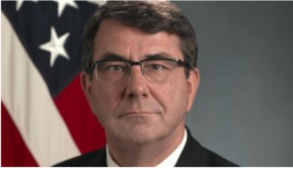
Former U.S. Defense Secretary Ashton Carter.