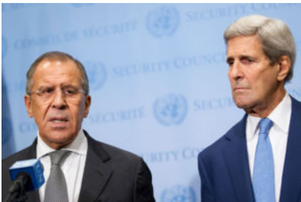
Secretary of State John Kerry (right) and Russian Foreign Minister Sergey Lavrov.

In public remarks bordering on the insubordinate, senior Pentagon officials a few days before the air attack on Sept. 17, showed unusually open skepticism regarding key aspects of the Kerry-Lavrov agreement – like sharing intelligence with the Russians (an important provision of the deal approved by both Obama and Putin).