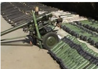
Terrorist receive recoilless guns from the former Yugoslavia.

“An official in Washington said the possibility of the transfers from the Balkans was broached last summer, when a senior Croatian official visited Washington and suggested to American officials that Croatia had many weapons available should anyone be interested in moving them to Syria's rebels.”