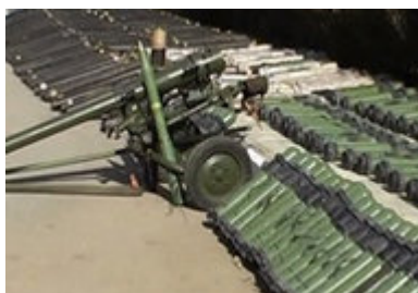
Terrorist receive recoilless guns from the former Yugoslavia.

“An official in Washington said the possibility of the transfers from the Balkans was broached last summer, when a senior Croatian official visited Washington and suggested to American officials that Croatia had many weapons available should anyone be interested in moving them to Syria's rebels.”