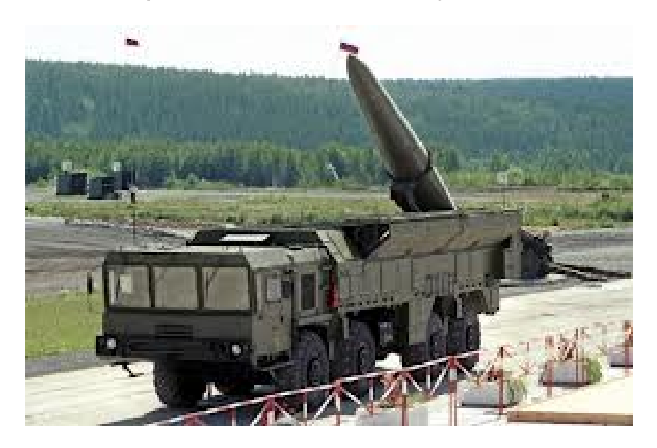
Iskander Mach 6-7

In recent developments, Syria took delivery of the more advanced Russian Iskander missile system, the Mach 6-7, in response to the deployment of US Made Patriot missiles in Turkey. Syria already possesses the less advanced E-Series Iskander. Syria is also equipped with the Russian ground to air defense missile system Pechora-2M. (see video below)