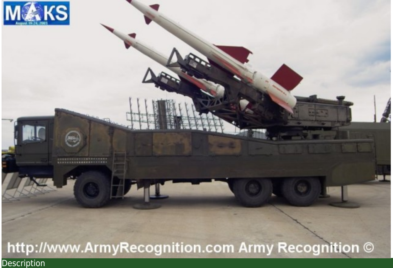
The Pechora-2M is a surface-to-air anti-aircraft short-range missile system designed for destruction of aircraft, cruise missiles, assault helicopters and other air targets at ground, low and medium altitudes.