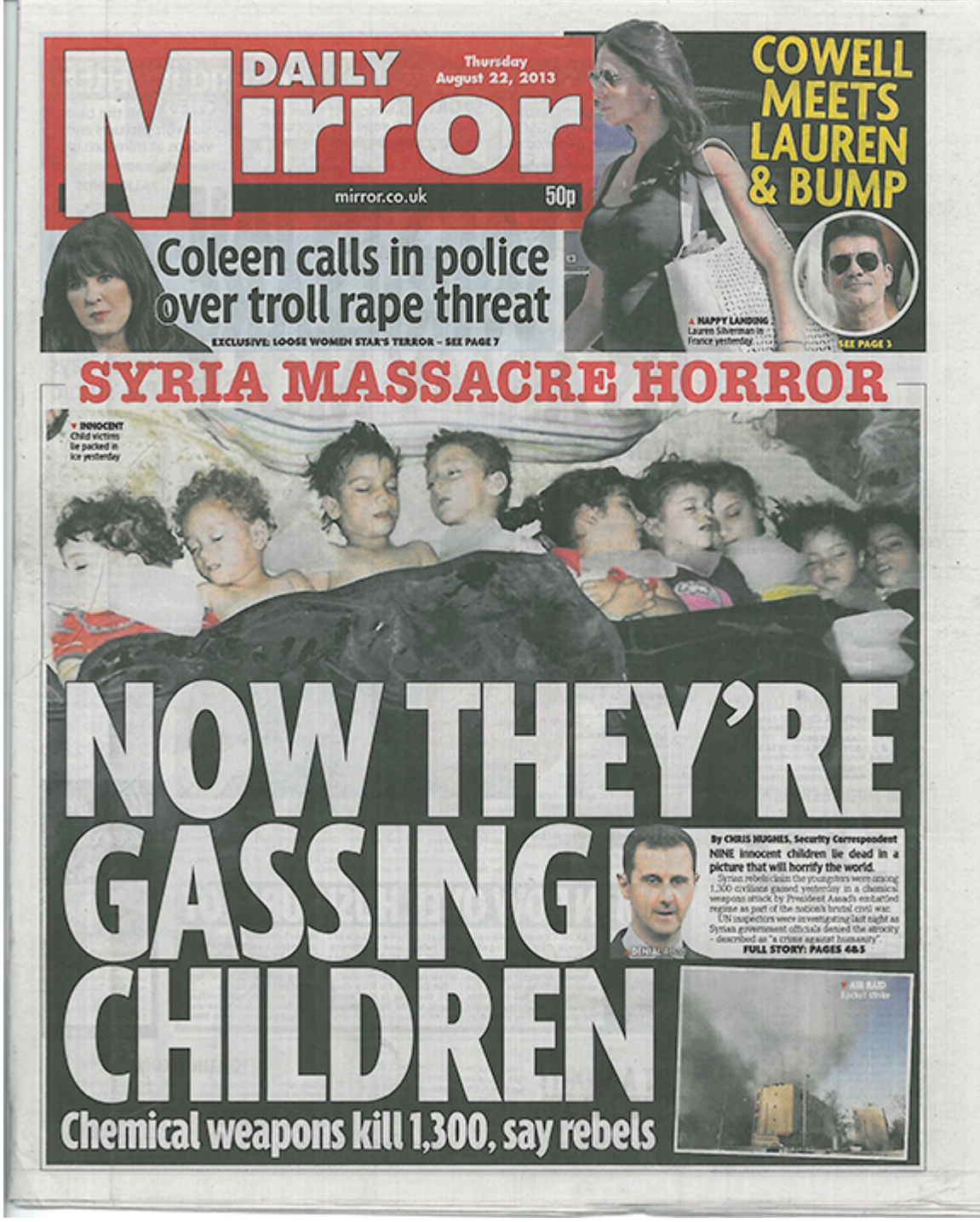
IMAGE: Today's headline on the UK Daily Mirror. Who are these children in the photo, are they alive and what exactly happened to them?

The press continue their PR campaign to intervention in Syria with the headline image (see below) for the Mirror depicts an image of eight children sleeping, and it is a fact that no one can independently verify as yet who these children are and if indeed they were killed in a chemical weapons attack in Syria on Tuesday evening. Nonetheless, the story and pictures run in the press and the desired public perception is created.