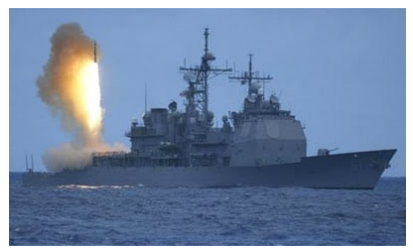
Aegis destroyers launching SM-3 "missile defense" systems

Translation: the SM-3 also has "anti-satellite" (ASAT) weapons capability. That means the Pentagon can use the Aegis-based missile to knock out Russian or Chinese satellites as part of a first-strike attack.