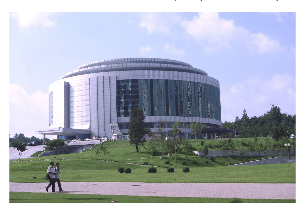
One of the many theatres in Pyongyang

the northern flooded area, and build new homes for the flood victims. His immediate assistance to the victims was admired by everyone in the country.