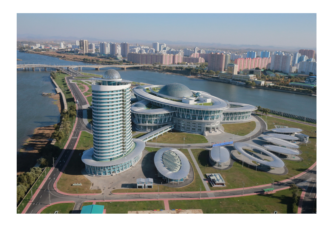
Aerial view of the Sci-Tech Complex

"By occupying all of Korea we could cut into pieces the one and only supply line connecting Siberia and the South..., control the whole area between Vladivostok and Singapore...nothing would then be beyond the reach of our power."