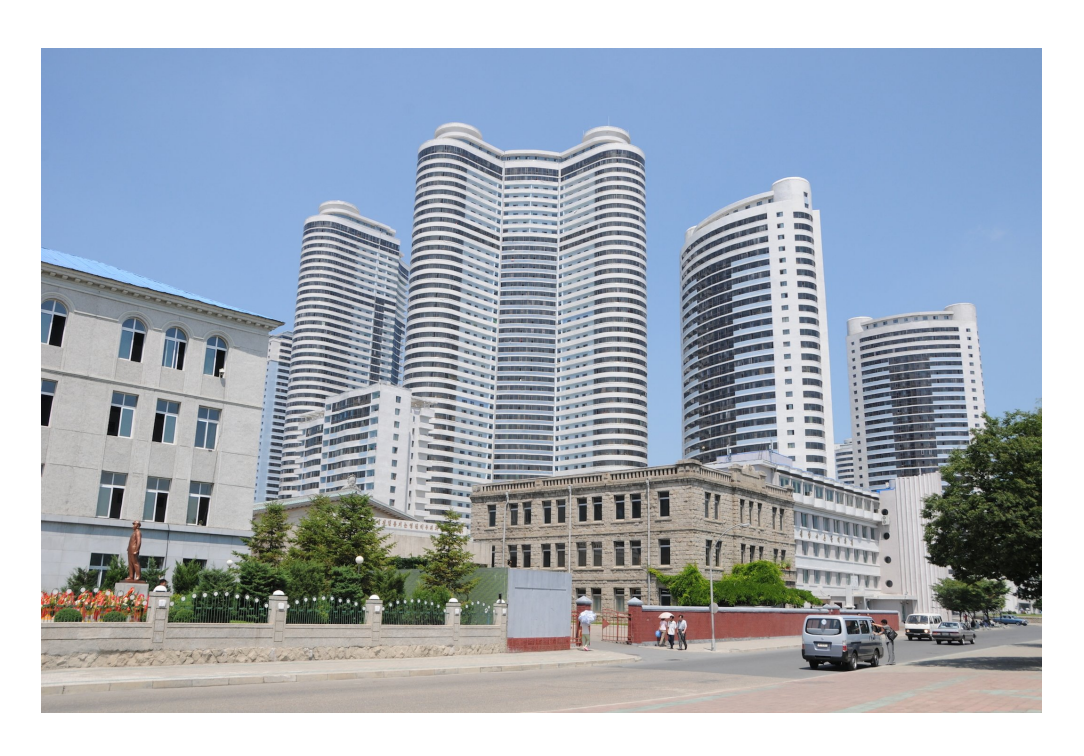
DPRK Free Public Housing

Prior to my visit, I was invited to submit a list of activities and people I wanted to visit in Pyongyang. Almost all my requests were honored during this visit.