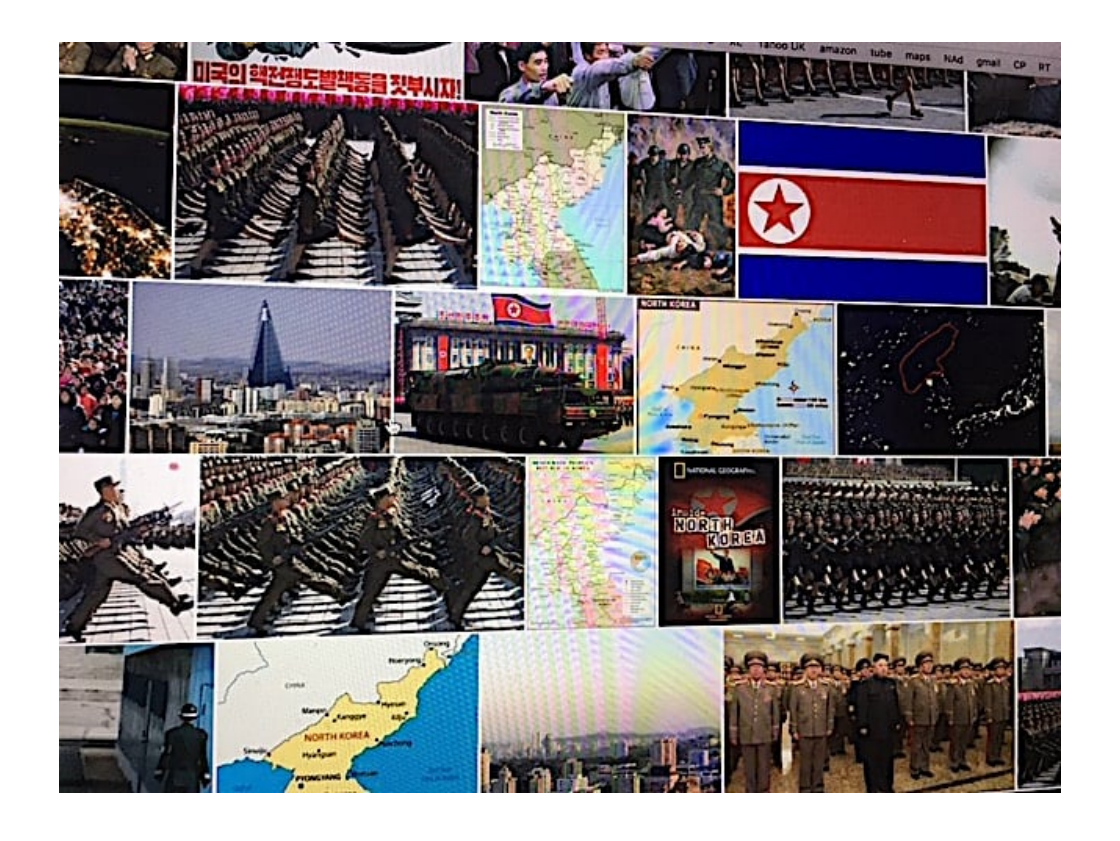
The way the West portrays DPRK

One of the greatest successes in totalitarian brainwashing has been achieved by the Western Media, which dominates too many people in the West, and within the UN system, who, ignorant of the realities of life within the DPRK, nevertheless challenged me with arrogance when I described what I had discovered during my actual, personal visit to the DPRK. None, and I repeat, none of these people had ever visited the DPRK, yet they held forth with aggression exceeded only by their ignorance, insisting, like imbeciles, that they, despite their complete dearth of accurate knowledge, knew what I had seen.