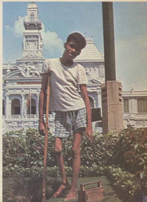
He was deformed by polio, but he stood in front of Saigon's City Hall every day—shining shoes, staying alive.