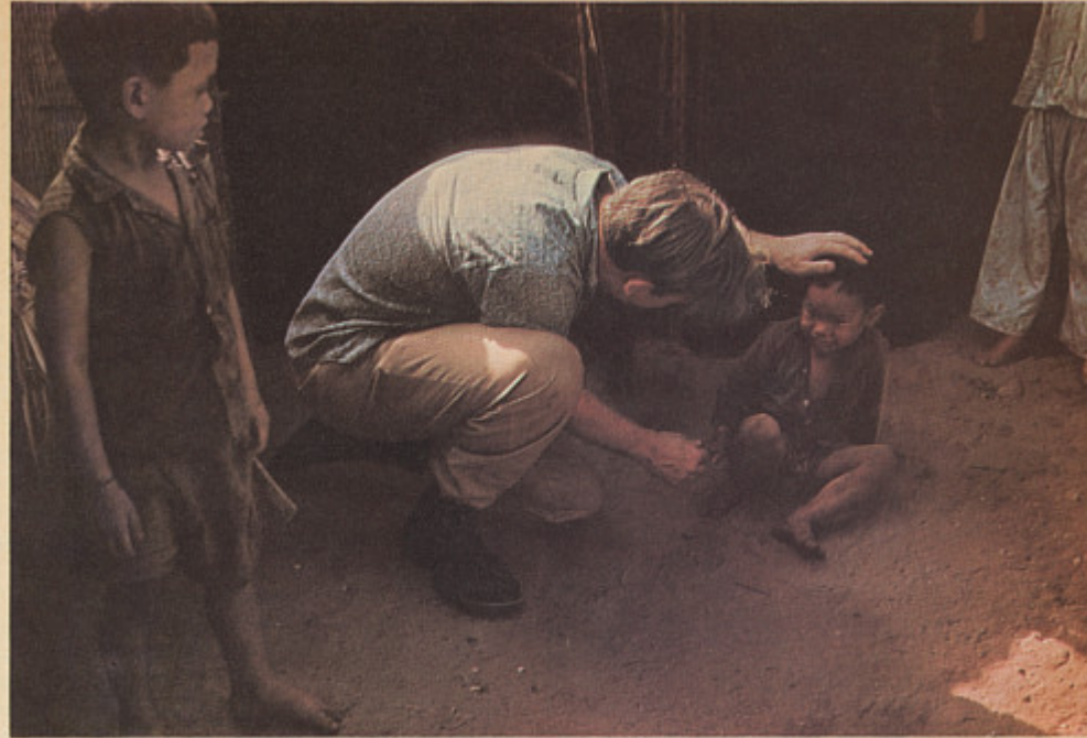
"In Sancta Maria Orphanage, I frequently became involved in trying, with a small amount of soap and a jar of Noxzema, to alleviate the festering infections that seemed to grow around every minor bite and cut."