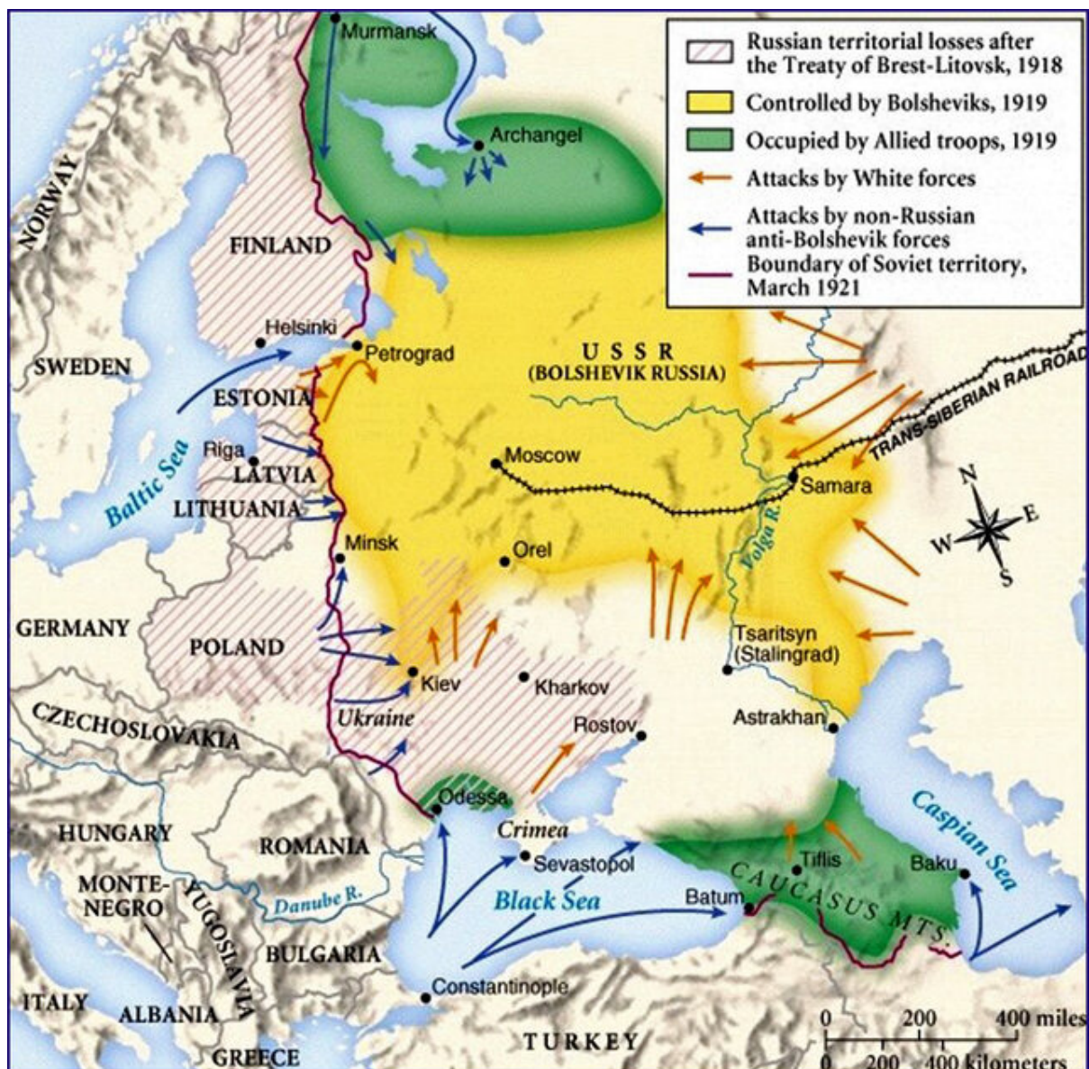
The Russian Civil War 1917

Winston Churchill was one of the main hawks in the Western camp. Taking advantage of the absence of Lloyd George and President Wilson at a summit meeting held in Paris on 19 February 1919, Churchill intervened to persuade the other governments to complete their intervention by directly supporting the army of the White Russian generals. He suggested sending them "volunteers, technical experts, arms, munitions, tanks, aeroplanes, etc." and "arming the anti-Bolshevik forces" [9].